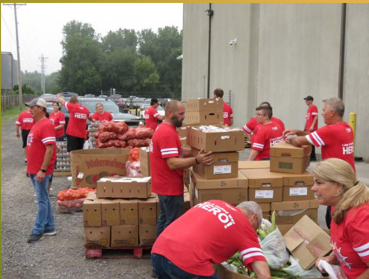
Day of Caring Volunteers helping at a Food Distribution at West Ohio Food Bank

Value of Volunteer Service $380,741.40 ($31.80 per volunteer hour)