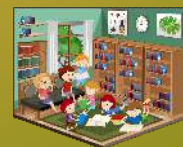
Daycare Centers, Head-Start Programs, After-School Programs