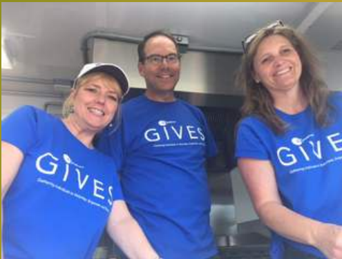
State Bank working in their State Bank Gives Vehicle handing out ice cream at a Wings & Rings Cruise-In Event

FY'23 951 & 780 (1,731) Volunteers Providing 6,710 & 5,263 (11,973 hours of their time!