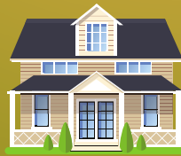
Senior Citizen Homes & Group Homes