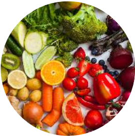
Produce - 1,895,803 lbs.