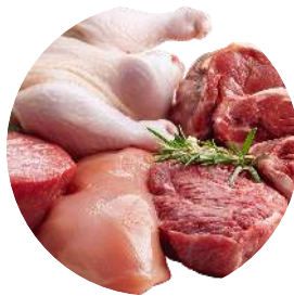
Meats/Fish/Poultry - 1,150,972 lbs.