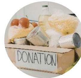
Mixed Foods - 596,908 lbs.