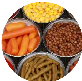
Canned/Frozen Vegetables - 551,731 lbs.