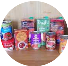
Complete Meals/Entrees/Soups - 602,798 lbs.